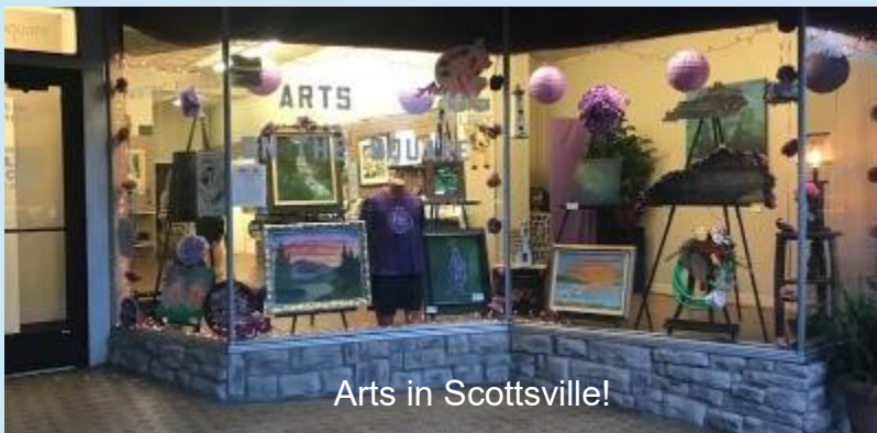
Arts in Scottsville!

Have you signed your Sublicense with the National Main Street Center?? These should have arrived in your inbox last week and should be electronically signed. These will then be forwarded to me for signature and then you will receive a copy with all signatures for your file!